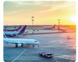
90 Mins drive from Warangal Mamnoor Airport