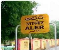
5Min. Drive from Aler Railway Station Railway station Few min Drive to Pembarthi Railway Station