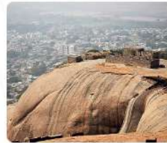
Proposed HMDA Township at Bhuvanagiri