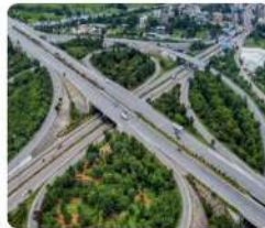
35Min. Drive from Outer Ring Road at Ghatkesar