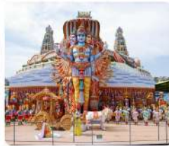
Indian Famous Mythological Museum in Surendrapuri