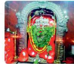
Very Near to Swayambhu Hanuman temple & 40' Hanuman statue