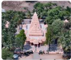
Very Close to World Famous Jain Temple at Kolanupaka