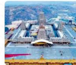
10Min. Drive from Yadadri Temple