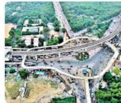
40Min. Drive from Uppal Ring Road