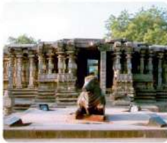
Near by Sri Swayamqu Someshwara Temple, Kolanupaka