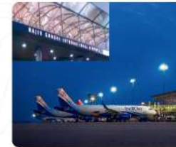
65Min. Drive from Rajiv Gandhi International Airport Shamshabad