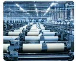
Very close to kallem Textile Park