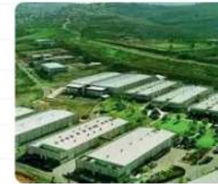
Proposed Bhuvanagiri Industrial Area (in 15000Acres.)