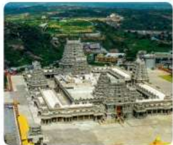
Near by Sri Laxmi Narasimhaswamy Temple, Yadagirigutta